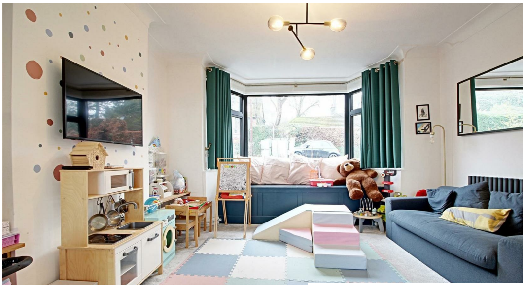
A simply stunning family home a stones throw from the town centre and amenities.